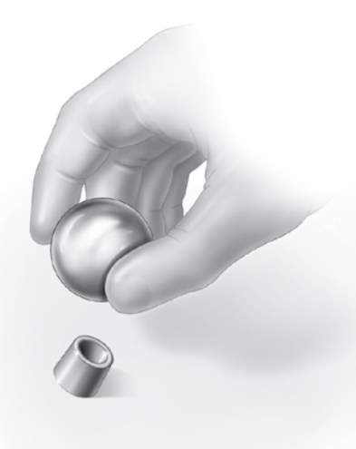
Figure 6 Placing the Femoral Head on the Adapter Sleeve