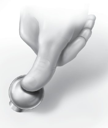
Figure 7 Applying Downward Manual Pressure